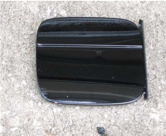
Fuel Door - $15