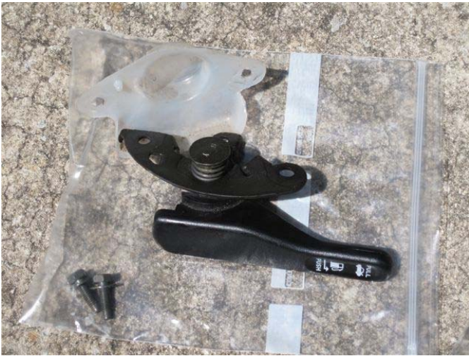
Trunk Release Mechanism - $10