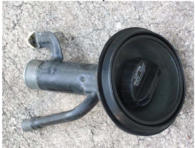
Fuel Filler Neck with Cap - $15